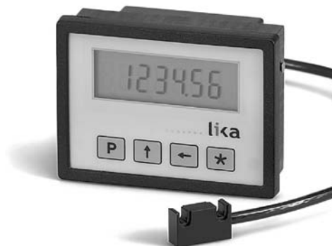
LD140 + SM25