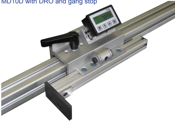
MD10D with DRO and gang stop