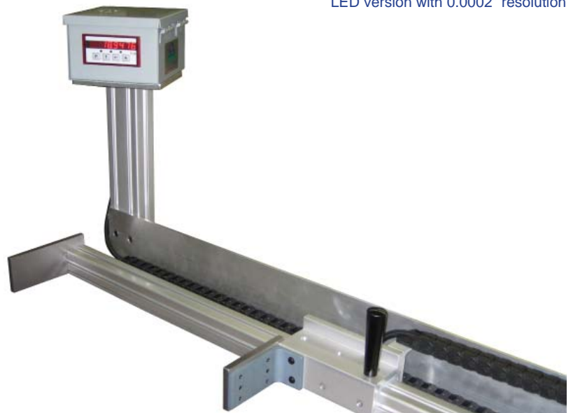
LED version with 0.0002" resolution